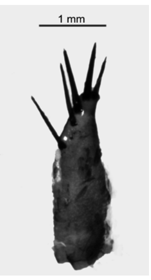
Fig. 10.– Right lamella of the Jullien organ of male Hipparchia fagi , surroundings of Dobraia (Caraş-Severin county), 30.vii.2007. Prep. genit. no. 669/Dincă.

Hipparchia syriaca might be more widespread in the southern parts of Romania, but its external similarity to H. fagi might have strongly limited the availability of reliable data concerning its general distribution in Romania. With the current data, it seems that H. syriaca reaches its northern Balkanic range limit in the north of Dobrogea (Măcin Mountains) (see also Kudrna 2002).