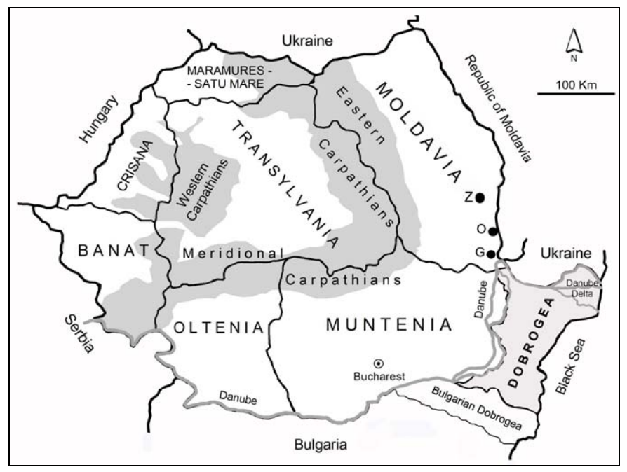
Fig. 1.– General map of Romania and its historical regions, indicating the position of the Romanian and Bulgarian parts of Dobrogea. Black dots – Locations outside Dobrogea discussed in the paper. Letters refer to the localities in table 1.

than in most other parts of Romania, the climate is still temperate continental with an average temperature of about 10.6–11°C in the north and above 11°C in the south (Rákosy & Székely 1996, Rákosy & Wieser 2000, Székely 2006). Dobrogea is one of the driest regions of Romania, with average rainfall values of about 450 mm/year in the Măcin Mountains (Rákosy & Wieser 2000), 330–440 mm/year in the Danube Delta (Székely 2006) and 350–400 mm/year in southern Dobrogea (Rákosy & Székely 1996). Depending on the year, these values might sometimes substantially increase (up to 600 mm/year in the Măcin Mountains) (Rákosy & Wieser 2000) or decrease (less than 150 mm/year in parts of the Danube Delta and less than 200 mm/year in southern Dobrogea) (Rákosy & Székely 2006).