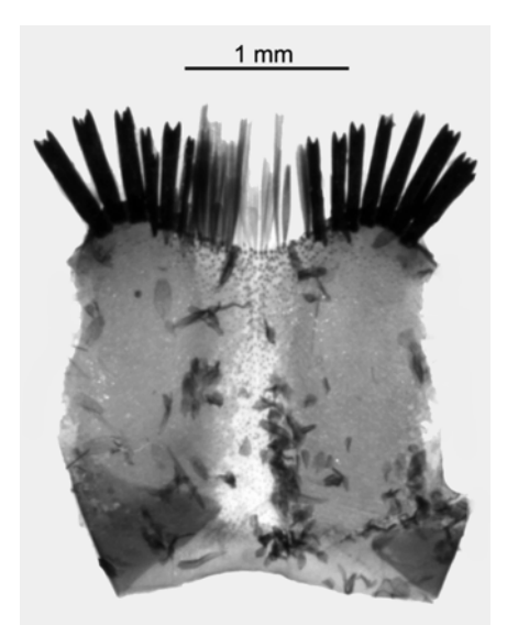
Fig. 9.– Jullien organ of male Hipparchia syriaca , ca. 10 km S from Babadag locality (Babadag forest, Tulcea county), 30.vi.2008. Prep. genit. no. 678/Dincă.

poorly known, as it is not clear how many of the records of H. fagi from this province were based on genitalia examination.