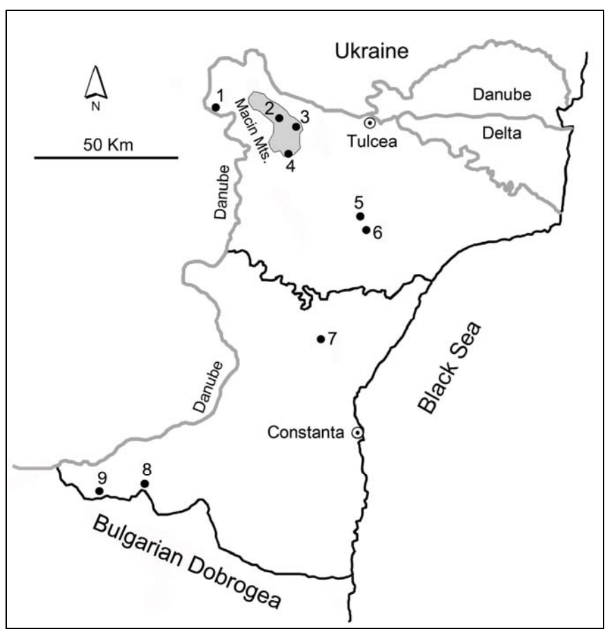
Fig. 2.– Map of the Romanian part of Dobrogea indicating the localities discussed in this paper. Numbers refer to the localities in table 1.

Belonging to the stepic eco-region, Dobrogea harbours a particular flora and fauna with many elements that are unique for Romania and even Europe. Rákosy & Wieser (2000) referred to Măcin Mountains as to a veritable bridge between Central Europe, the Balkans, Asia Minor and the Russian steppe. Given its geographic position and species composition, we would extend this affirmation to the entire Dobrogea. Of particular biogeographical interest are the Russian steppe elements or the pontic elements from Asia Minor that reach Dobrogea and in many cases do not infiltrate deeper into Western Europe.